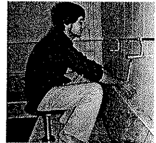
Muslim foot bath

At least nine universities have prayer rooms for "Muslim students only," including Stanford, Emory and the University of Virginia.